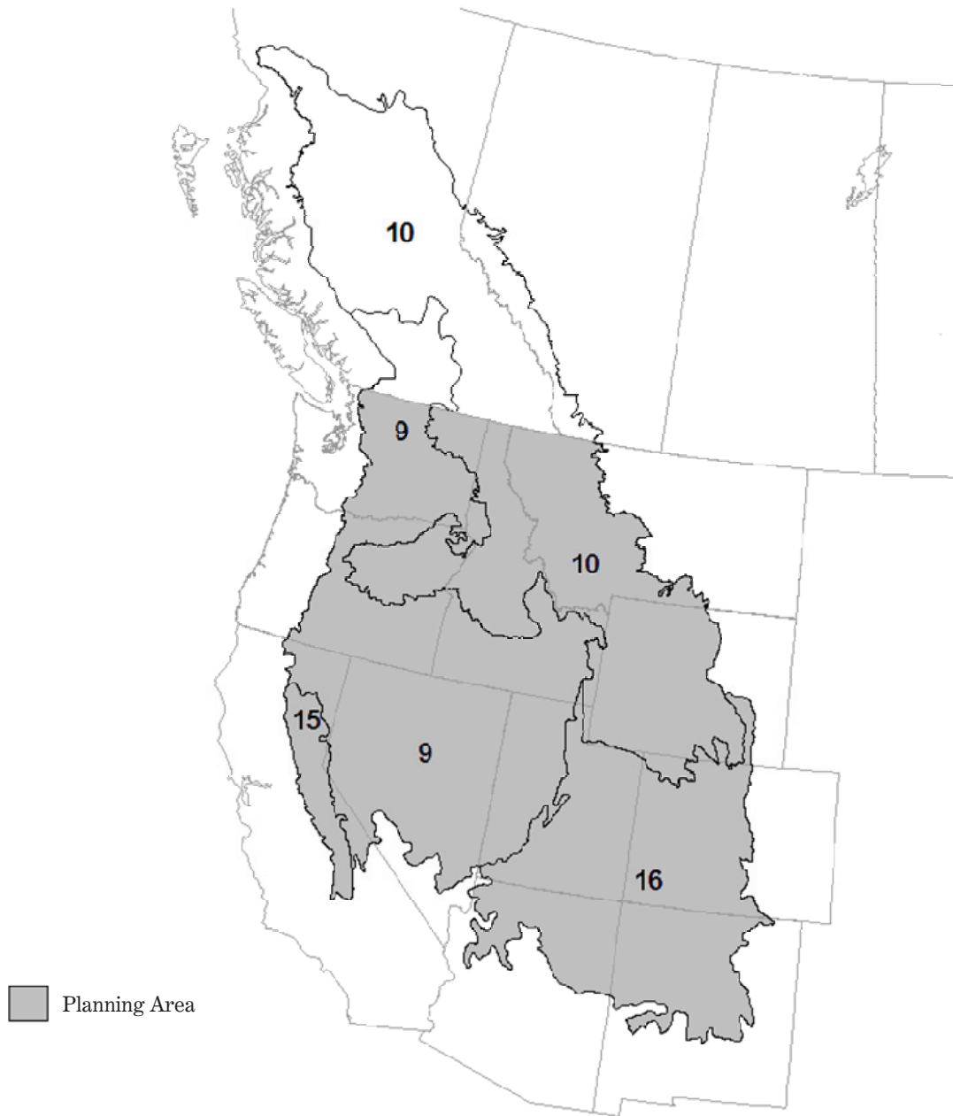
Figure 1. Intermountain West Waterbird Conservation Plan planning area.